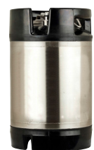
RSR SD 102